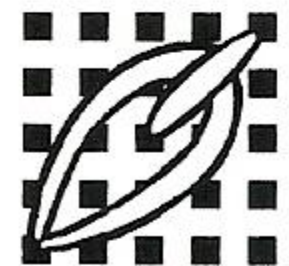
Lazy daisy stitch