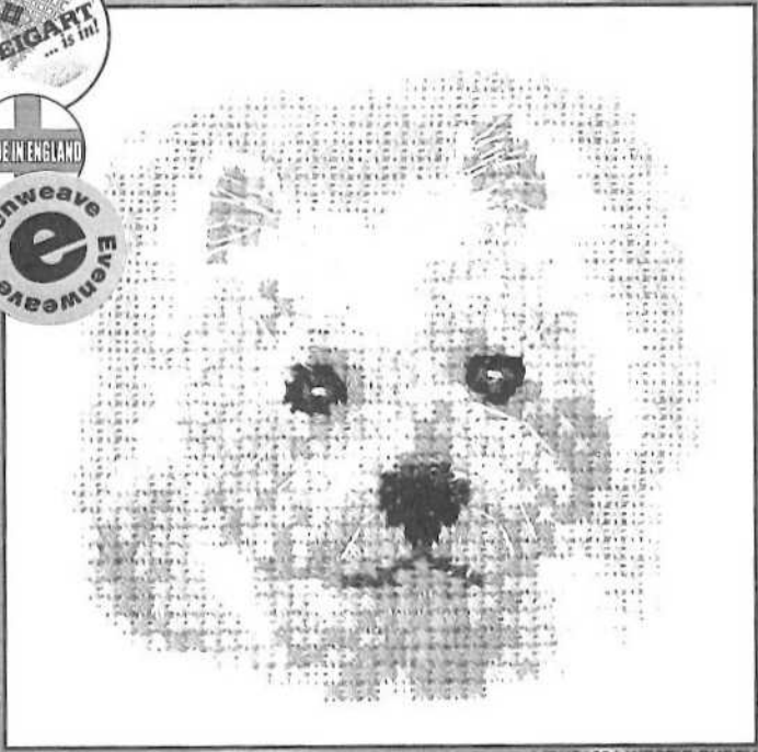
LFWP1031 WESTIE PUPPY

These small designs are for working on 27 count lida or 14 count aida fabric. Kits contain Zweigart fabric, charts and instructions, needle and DMC stranded cottons. Approx. design size: 2 3/4" sq, 7cm sq.