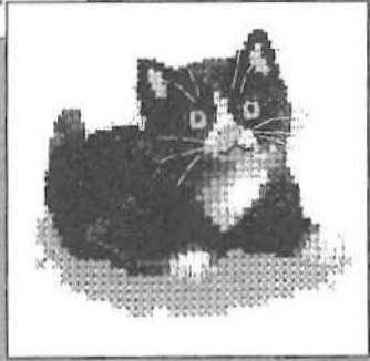
LFBW1021 BLACK AND WHITE KITTEN