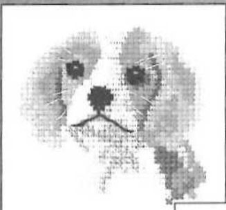
LFSN1026 SPANIEL PUPPY