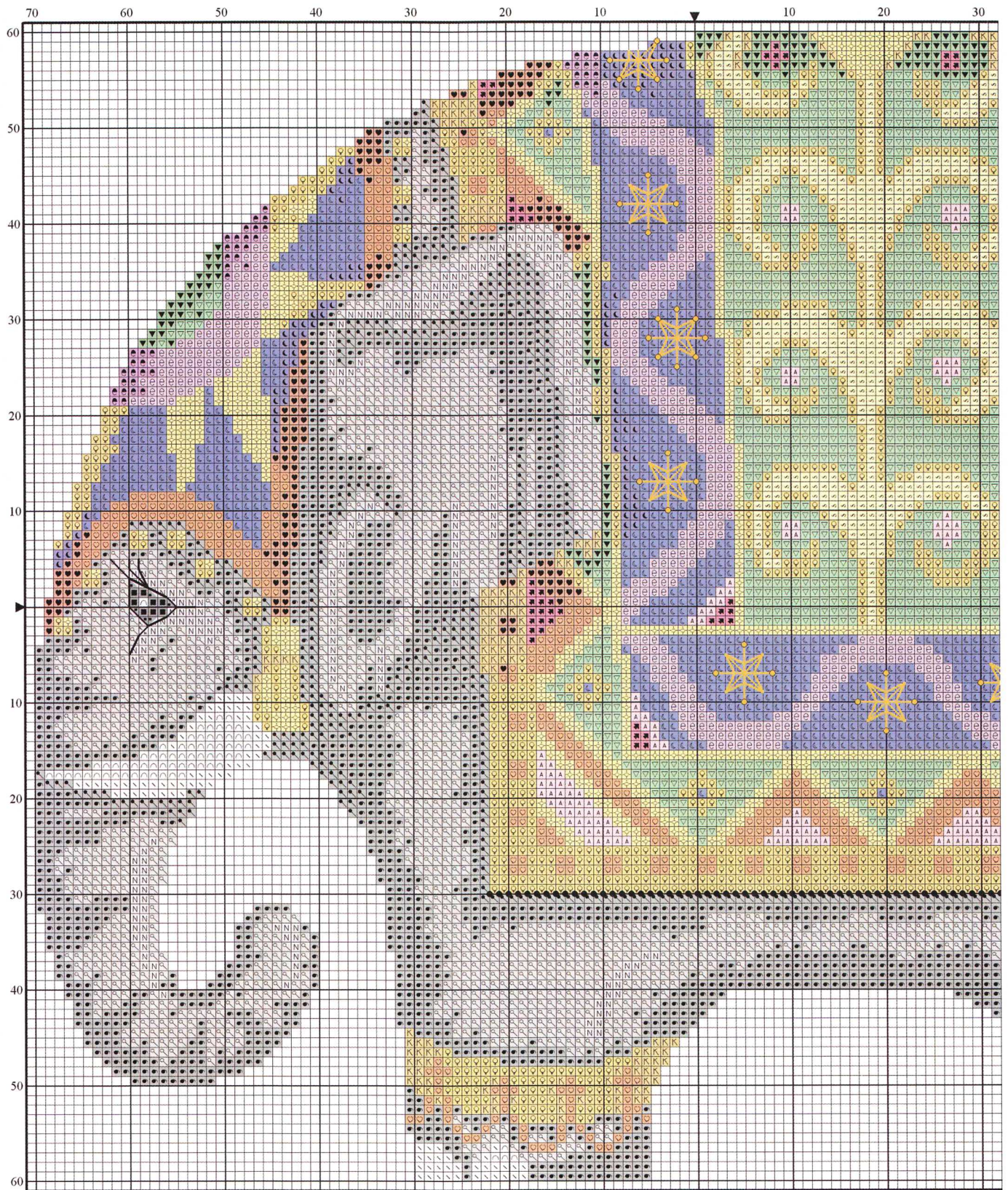
Elephant tea cosy chart (left)