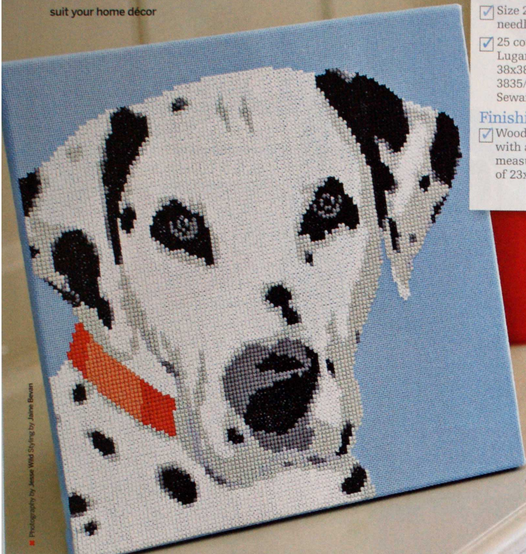
Photography by Jesse Wild Styling by Jaime Bevan

Below You can alter the colour of the fabric to suit your home décor