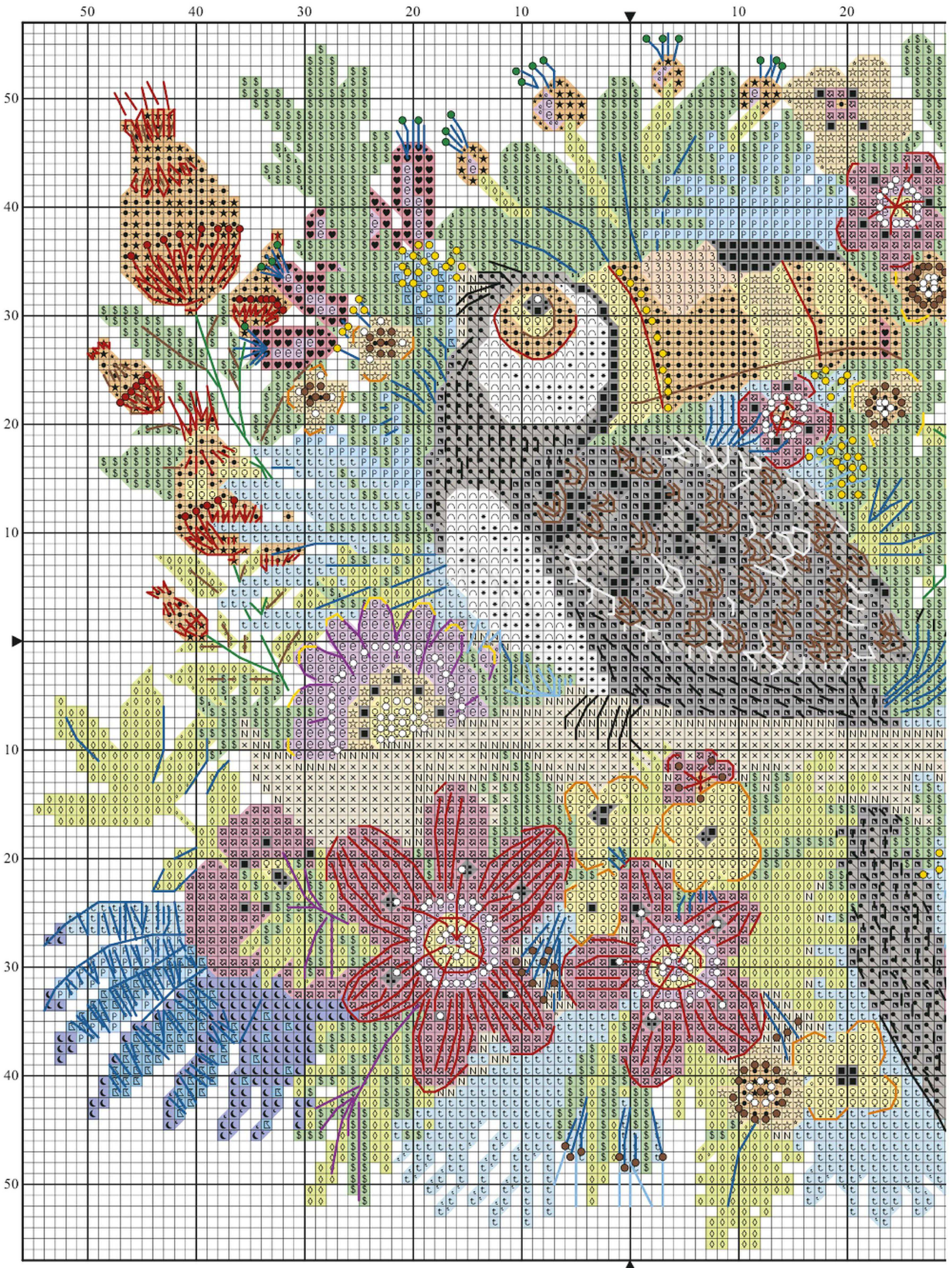
Colourful Toucan chart (left)