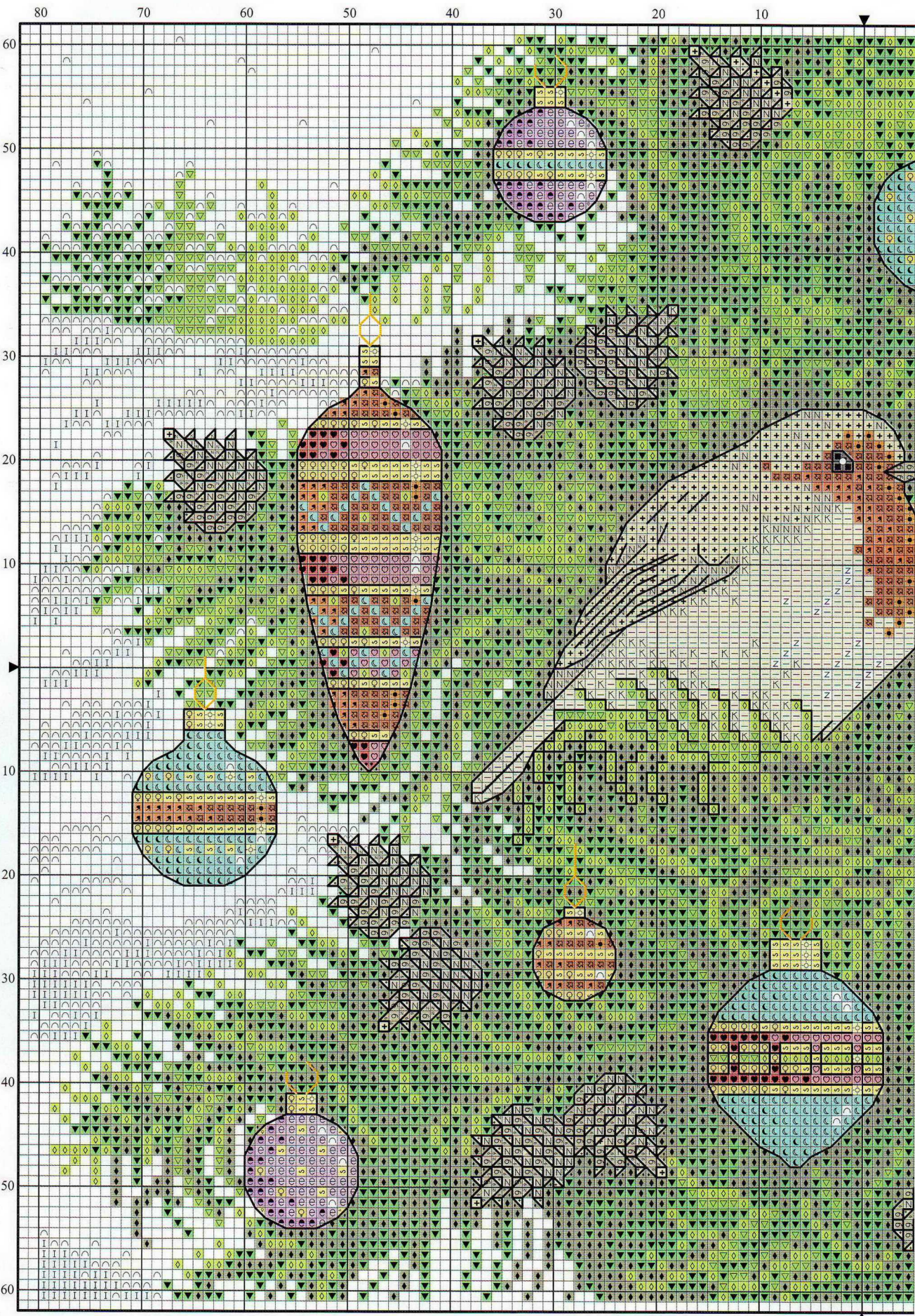
Christmas birds chart (left)