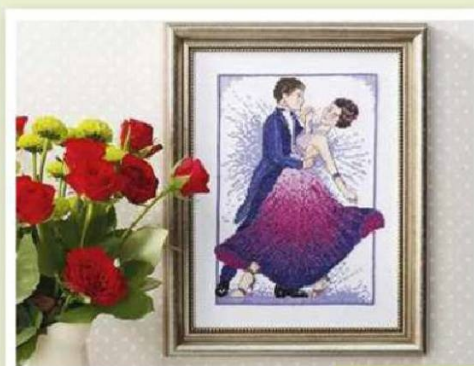
▲ Cross Stitch Crazy 180, £6.35