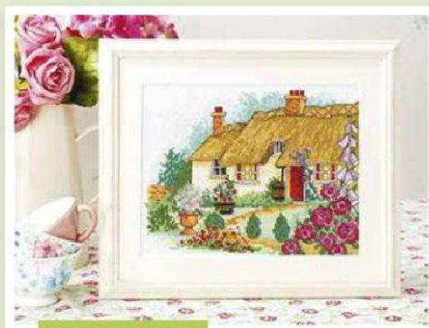
▲ Cross Stitch Crazy 179, £6.35