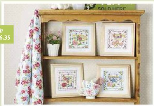
▶ Cross Stitch Crazy 179, £6.35