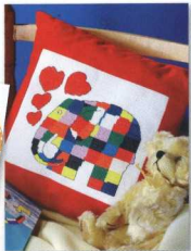
Our Elmer cushion, featured in Issue 83